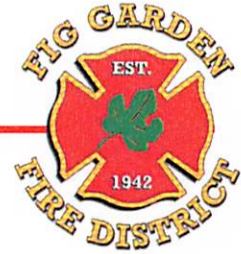
FIG GARDEN FIRE PROTECTION DISTRICT Board of Directors – Regular Meeting Minutes January 29, 2026 4:00PM Station 20 – 4537 N Wishon

911 H Street Fresno, California 93721 (559) 621-4199 FAX (559) 498-4261